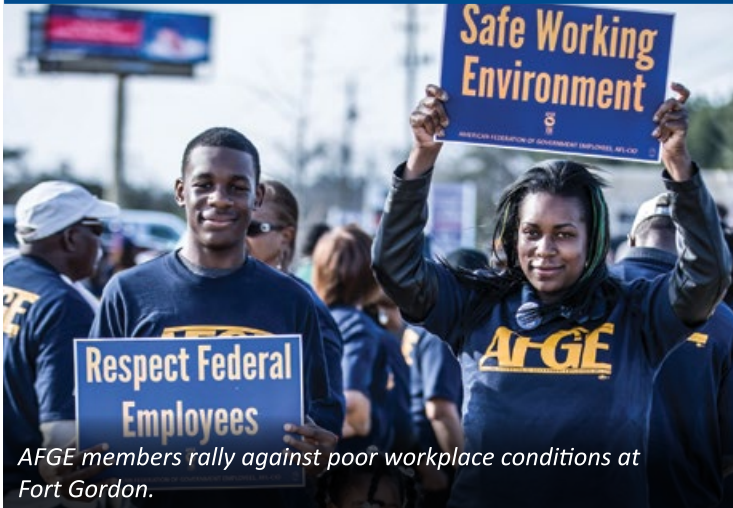
AFGE members rally against poor workplace conditions at Fort Gordon.

M any of the buildings at Georgia's Fort Gordon are contaminated with asbestos and mold. Yet when workers complain, management retaliates. Workers have had enough.