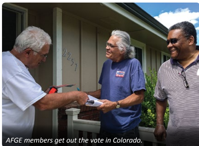
AFGE members get out the vote in Colorado.

Our union brothers and sisters are critical to our democracy. In a time when those with enough money can change the rules in their favor, we must stand up for all Americans. We must ensure that all citizens of this country can breathe clean air, eat and drink clean food and water, feel safe and secure in their communities, and have the same chance at life, liberty, and the pursuit of happiness that was promised to us when our country was founded.