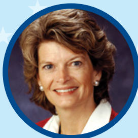
Lisa Murkowski Senate (Alaska)

C ontrol of the U.S. Senate is just as important to your job as control of the White House. Senators fund our agencies, start and end shutdowns, determine our pay and benefits, and more. These candidates need your support so that can build a better future for us all.