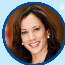
Kamala Harris Senate (Calif.)

AFGE endorses Ann Kirkpatrick for Senator from Arizona. Kirkpatrick opposes privatization of Social Security and Medicare. She supports border agents and law enforcement officials and opposed cuts to federal funding for border security.