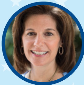
Catherine Cortez Masto Senate (Nev.)

AFGE endorses Maggie Hassan for Senator from New Hampshire. She will ensure our seniors get the Social Security benefits they earned and strengthen the VA. She is a leading supporter of the Paycheck Fairness Act to guarantee women equal pay for equal work.