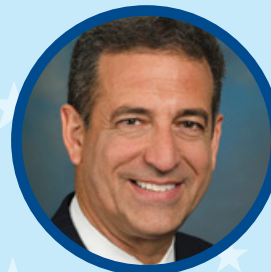
Russ Feingold Senate (Wis.)

AFGE endorses Katie McGinty for Senator from Pennsylvania. McGinty supports raising the minimum wage to $15 an hour. McGinty believes that those who want a good education shouldn't have to go broke to get one.