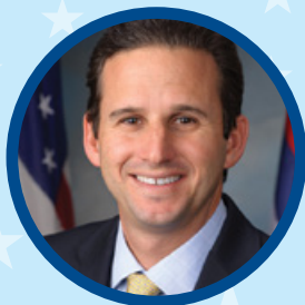
Brian Schatz Senate (Hawaii)