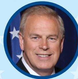
Ted Strickland Senate (Ohio)

AFGE endorses Catherine Cortez Masto for Senator from Nevada. She's dedicated to raising the minimum wage, ensuring working people get paid fairly, and stopping job-killing trade deals. She will fight for legislation that keeps and creates American jobs.