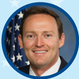
Patrick Murphy Senate (Fla.)

AFGE endorses Richard Blumenthal for Senator from Connecticut. As Senator, he's been a staunch friend to VA employees and the veterans they serve. He introduced legislation to improve veterans' health care and protect workers' fundamental rights.