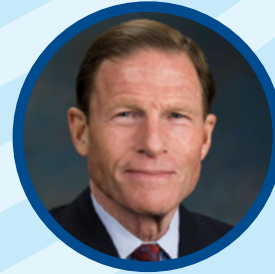
Richard Blumenthal ★ Senate (Conn.)

AFGE endorses Michael Bennet for Senator from Colorado. He opposed shutdowns and fought for a federal budget that works for all Americans. His student loan policies have opened opportunities for young people by reducing college debt.