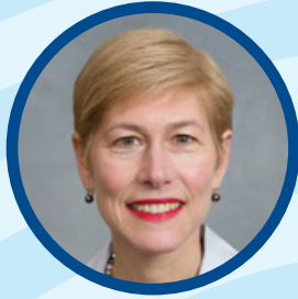
Deborah Ross Senate (N.C.)

AFGE endorses Deborah Ross for Senator from North Carolina. She's fought to get our veterans the care and benefits they were promised. She understands that the best way to grow our economy is to create good jobs and stop shipping them overseas.