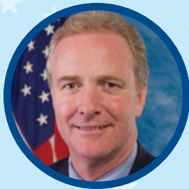
Chris Van Hollen Senate (Md.)