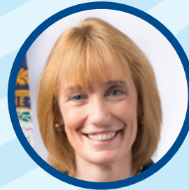
Maggie Hassan Senate (N.H.)

AFGE endorses Deborah Ross for Senator from North Carolina. She's fought to get our veterans the care and benefits they were promised. She understands that the best way to grow our economy is to create good jobs and stop shipping them overseas.