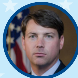
Conner Eldridge Senate (Ark.)

AFGE endorses Lisa Murkowski for Senator from Alaska. As Senator, she defended federal employees' workplace rights and fought for fair wages. She's stood with us to stop shutdowns and worked to ensure we have the resources we need to serve all Americans.