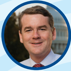
Michael Bennet Senate (Colo.)

AFGE endorses Michael Bennet for Senator from Colorado. He opposed shutdowns and fought for a federal budget that works for all Americans. His student loan policies have opened opportunities for young people by reducing college debt.