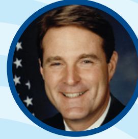
Evan Bayh Senate (Ind.)

AFGE endorses Tammy Duckworth for Senator from Illinois. As a proud veteran and longtime advocate for the VA. She's worked to end veteran suicide and homelessness. She opposes bad trade deals and will fight for affordable college education.