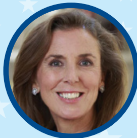
Katie McGinty Senate (Pa.)

AFGE endorses Ted Strickland for Senator from Ohio. He would fight to increase the minimum wage and ensure proper payment for overtime work. He will fight to empower employees at the negotiating table by protecting and expanding their union rights.