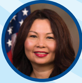
Tammy Duckworth Senate (Ill.)

AFGE endorses Tammy Duckworth for Senator from Illinois. As a proud veteran and longtime advocate for the VA. She's worked to end veteran suicide and homelessness. She opposes bad trade deals and will fight for affordable college education.